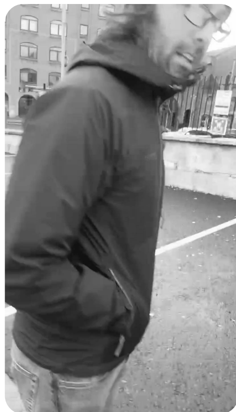
British intelligence agent approaching members of Saoradh in Derry.

Anti Imperialist Action and An Phoblacht Abú extend our solidarity to all who have been approached by MI5 and we call on all who are approached to come forward and expose the shadowy actions of British Military Intelligence so as Republicans can drag them into the light where they are unable to operate. Republican activists can contact us in confidence if they are approached by British intelligence services, or failing that, we would advise you to approach a solicitor.