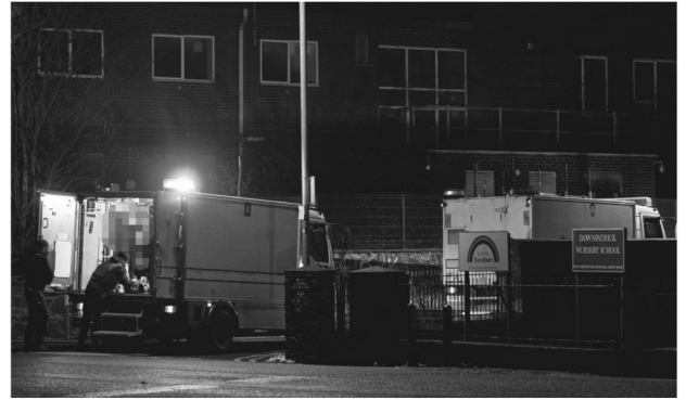
British bomb squad, Downpatricks.

October 28 - The British Army carried out a controlled explosion on a device close to the courthouse in Downpatrick, County Down. The incident saw large numbers of the British Army on the streets backed up by the RUC and resulted in the Gaol Lane area being closed off for several hours.