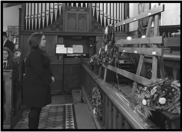
Above: McDonald lays a wreath for British soldiers in St Patrick's Cathedral, Dublin.