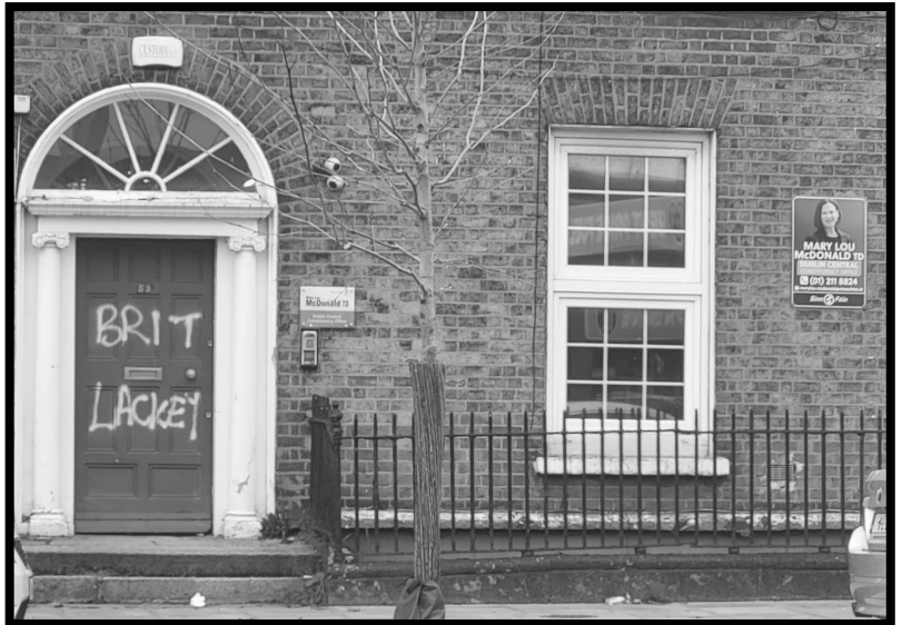
Right: AIA action against McDonald's Office.

Not to be outdone in the pro-Imperialist Olympics by her deputy or the other members of the Free State establishment, the Sinn Féin Leader was front and centre at a memorial service for the British forces of Occupation in Ireland held in St Patrick's Cathedral, Dublin and organised by the British Legion. This event also honours serving members of the British Military and the RUC, those imperialist forces that continue to occupy our country and wage a low intensity war against the Republican community every day. Mary Lou took the current Free State Election campaign as an opportunity to further distance herself and Sinn Féin from the legitimate Armed Struggle for Irish National Liberation by stating today's incarnation of Sinn Féin cannot be held accountable for the actions of the IRA.